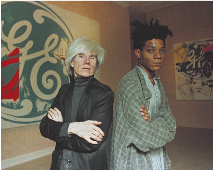
Andy Warhol was one of the most influential painters of the 20th century. His colleague, Jean-Michel Basquiat, was also an extremely promising artist. His addiction to heroin, which led to a fatal overdose, provides one example of the destructive impact of mental disorders.